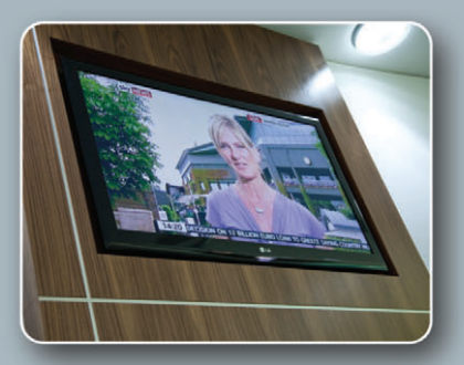
Media Wall, Feature Doors & Bespoke Coffee Table

Finished in crown cut walnut veneer with brushed aluminium feature inlay banding and plinth